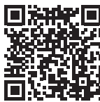
PRT Bus Routes