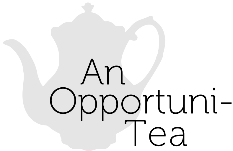
Table Sponsor Packet

Event Hall ICCU Bengal Alumni Event Center