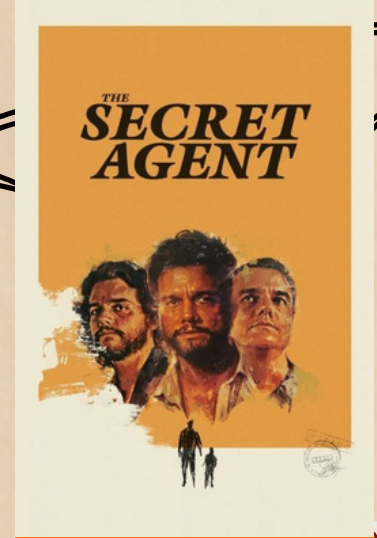
The Secret Agent (R) April 26 - 4pm & 7pm