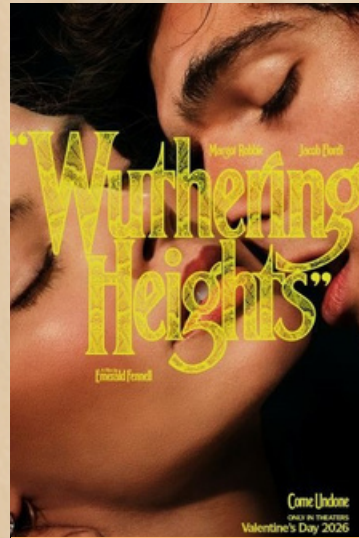
Wuthering Heights (R) April 23 & 24 - 7pm April 25 - 4pm & 7pm