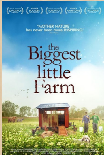
The Biggest Little Farm (PG) April 19 - 4pm & 7pm $1 admission