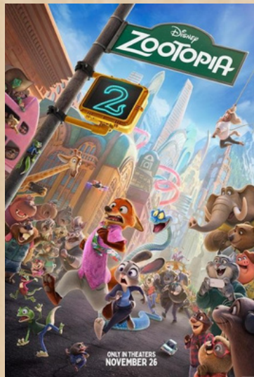
Zootopia 2 (PG) April 11 - 4pm & 7pm