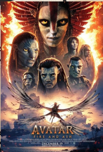
Avatar: Fire and Ash (PG-13) April 8, 9, & 10 - 7pm