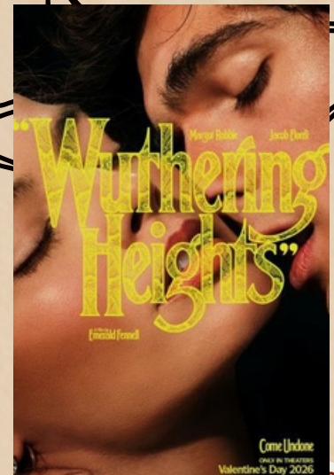
Wuthering Heights (R) April 23 & 24 - 7pm April 25 - 4pm & 7pm