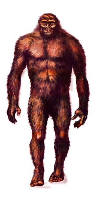
Figure 3 . Eyewitnesses' impression of the appearance of the yeren .