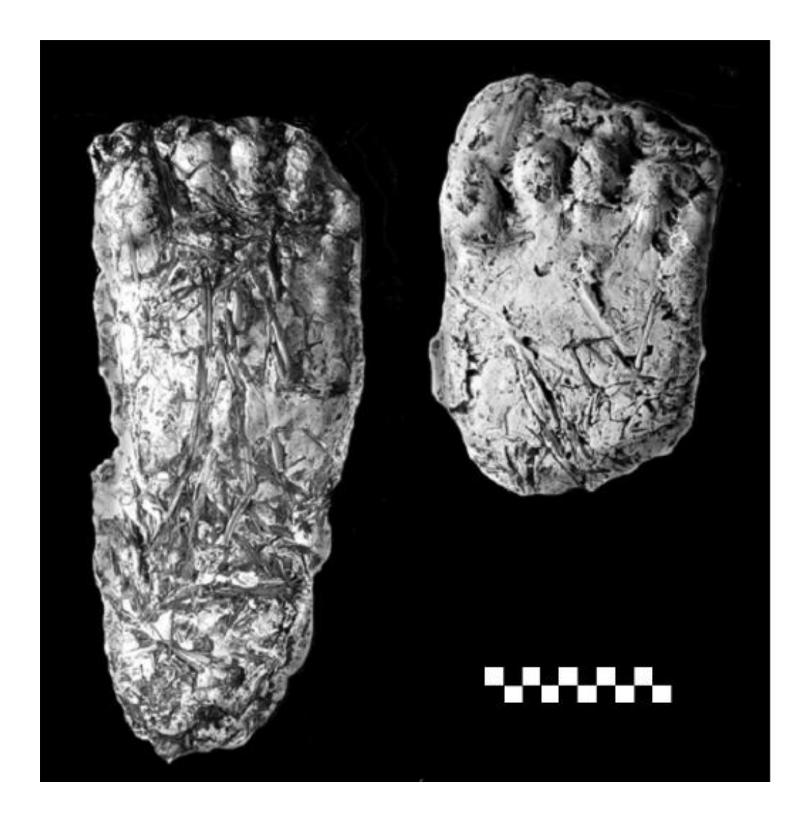
Figure 11. Casts made by Meldrum in 1996 near Walla Walla, Washington, comparing a full-length footprint with a "halftrack" illustrating the flexibility at the transverse tarsal joint.