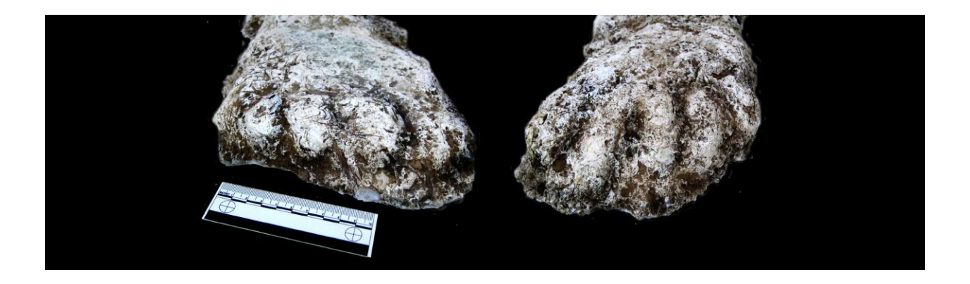
Figure 5. Distal view of the footprint casts illustrating the digits.