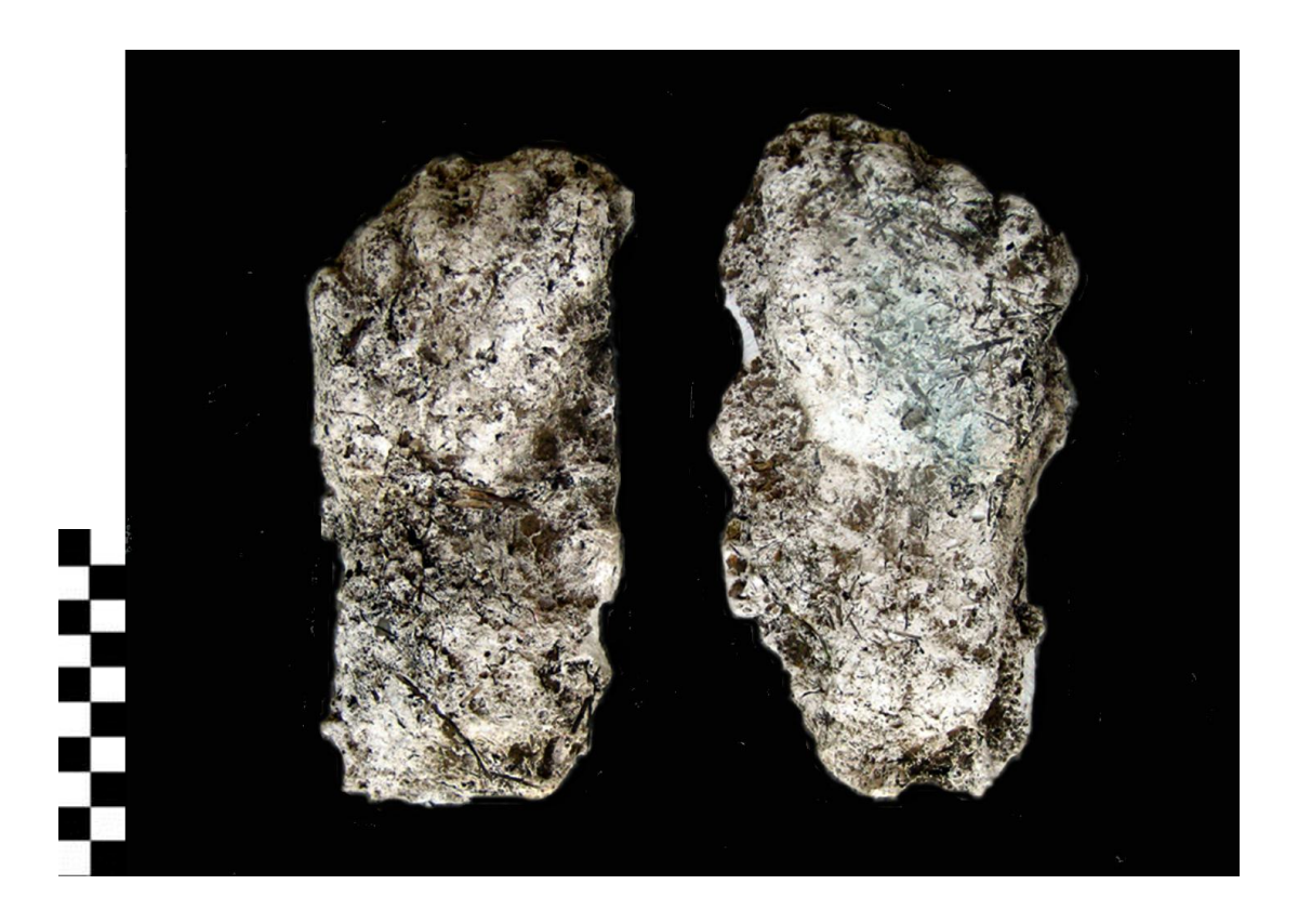
Figure 4. Footprint casts of the yeren collected by Yuan Yuhao in the Shennongjia Reserve.