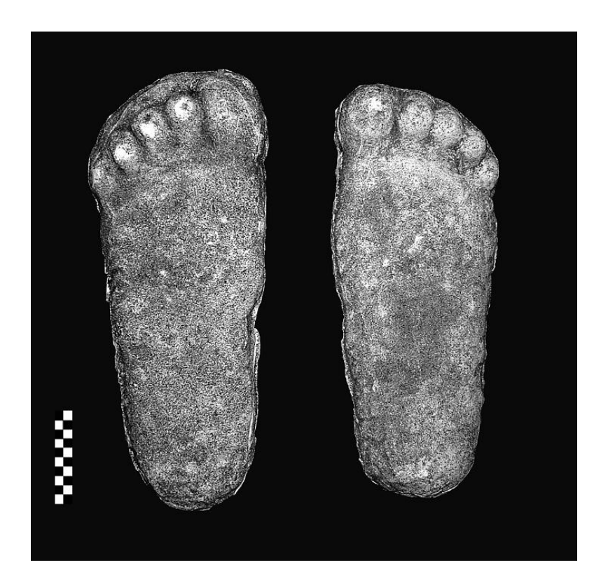
Figure 9. Footprint casts from Bluff Creek, California, made by Roger Patterson October 1967, constituting the type of the ichnotaxon Anthropoidipes ameriborealis MELDRUM 2007.