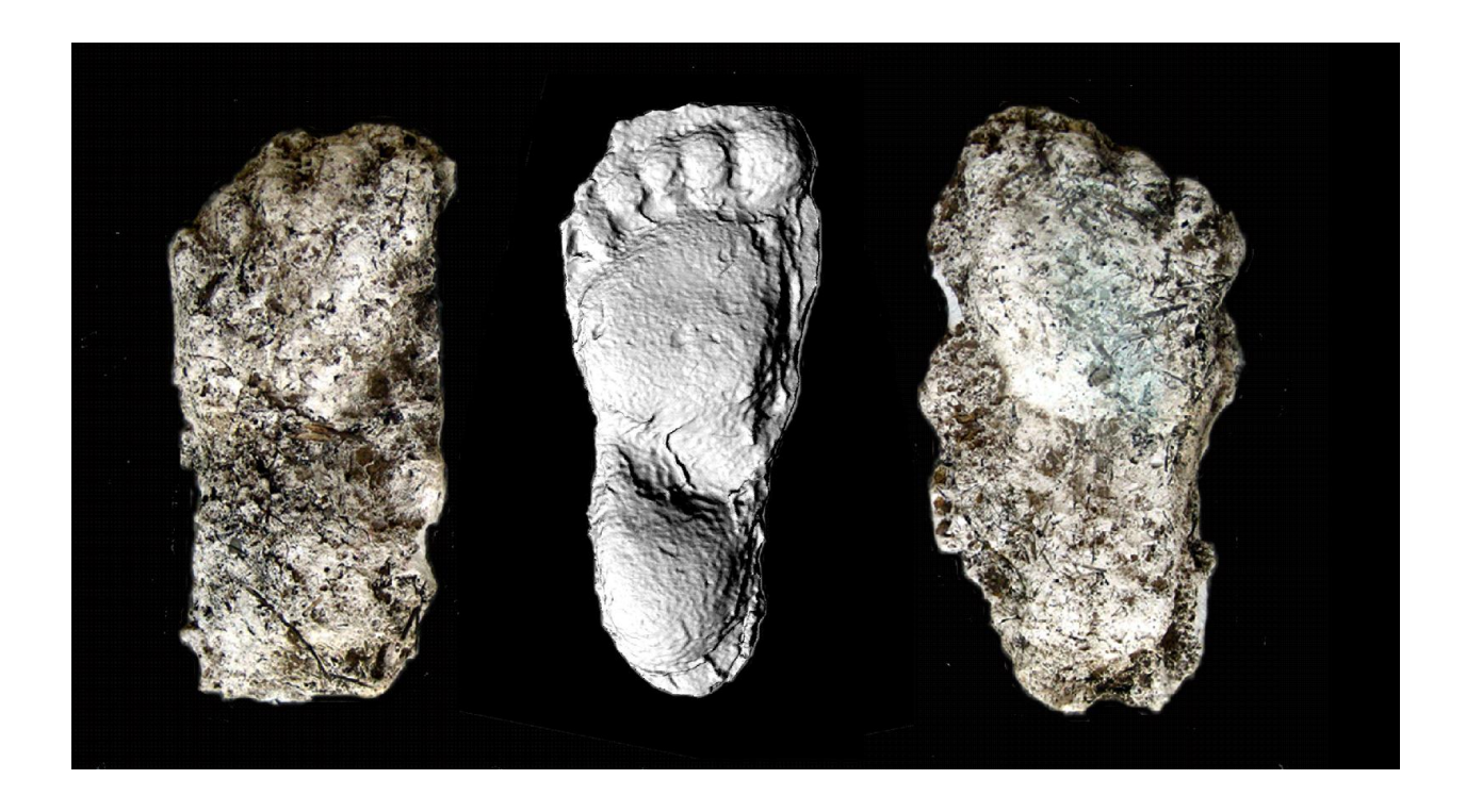
Figure 6. Comparison of the yeren footprint casts with a cast from the Patterson-Gimlin film site (Bluff Creek, California) attributed to the sasquatch (center).