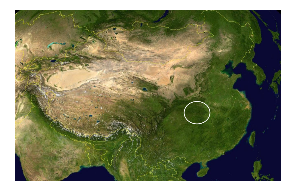
Figure 1. Satellite image of eastern Asia. Circle indicates region centered in Hubei Province, China, where numerous sightings of the yeren have been reported.