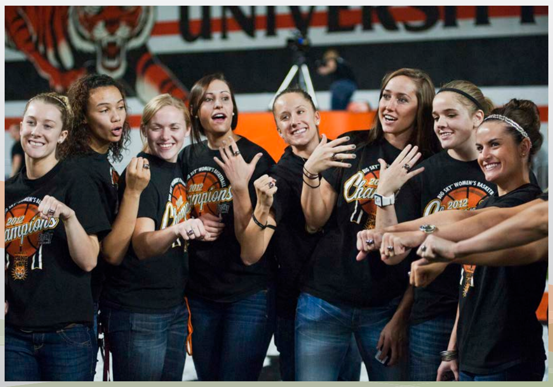
ISU women basketball team show off their championship rings

their athletes, the ISU athletic department helped her with everything from study skills