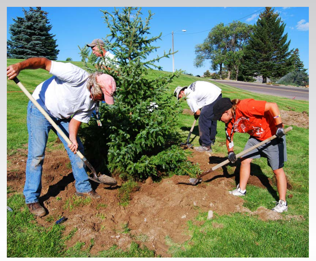
Landscape and Grounds crew at work