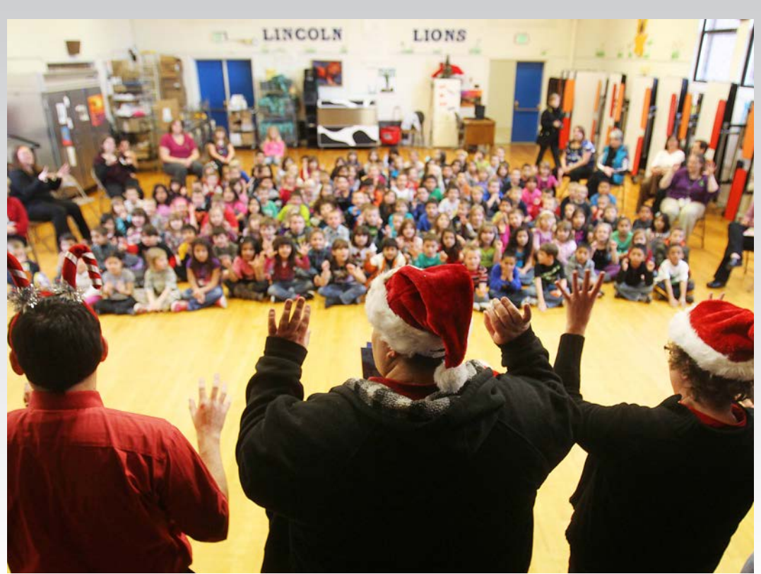
1st and 2nd graders at Lincoln Elementary, Twin Falls.