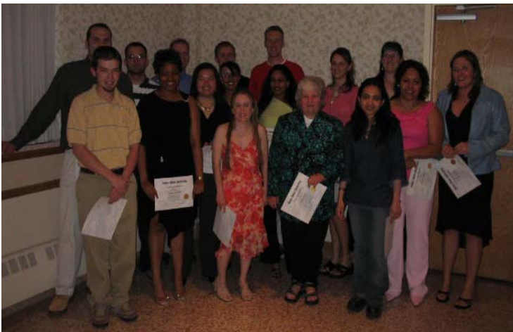
ISU Leadership Academy members received certificates and pins during the program's 2005 closing ceremonies