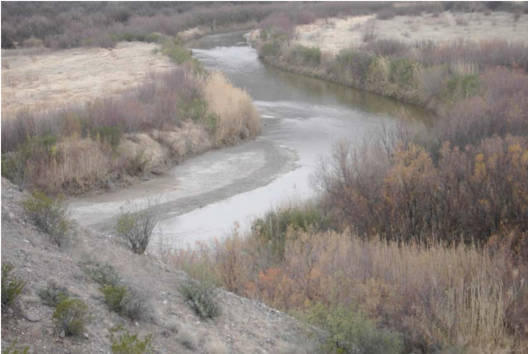
Figure 4. Rio Grande River habitat forms the southern boundary of Big Bend National Park, Texas with that of Mexico.