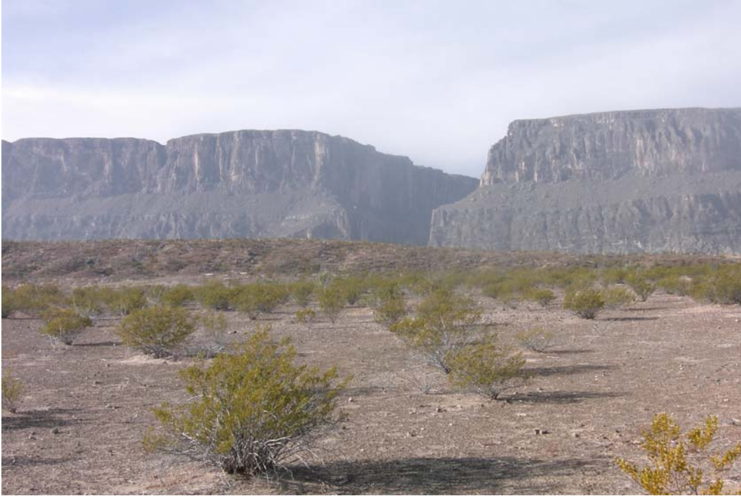
Figure 3. Chihuahuan Desert habitat is abundant in Big Bend National Park, Texas. The desert surrounds the Chisos Mountains.