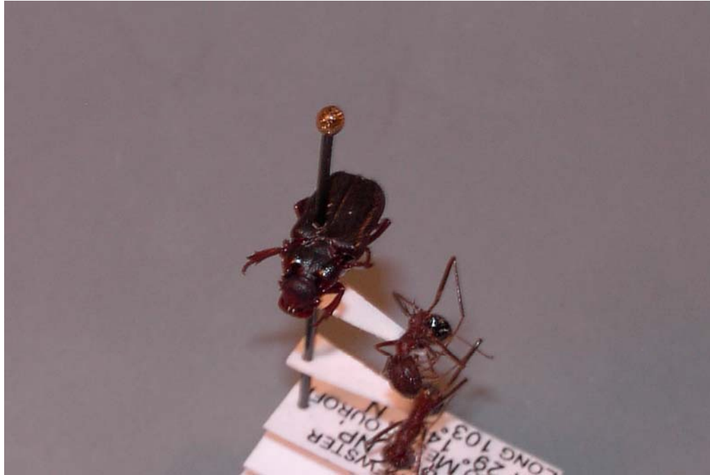
Figure 6. Example of myrmecophile, Coleoptera, Cremastocheilus found associated with the ant Aphaenogaster cockerelli at Burro Mesa Pouroff, Big Bend National Park, Texas , July 2000.

ants (Clark and Blom 1988) but little is known about these relationships. These beetles have not been collected frequently in the Park; however they may be more common than collections indicate, as they can be very cryptic.