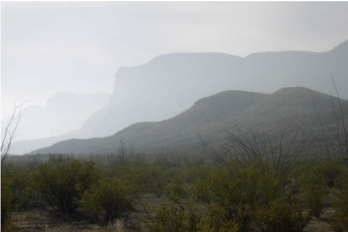
Figure 2. Chisos Mountains habitat in the center of Big Bend National Park, Texas. These are a dominant feature in the park.

Big Bend National Park offers diversified habitats from high forests in the Chisos Mountains (Figure 2) descending to pine-juniper associations to grasslands, and then to distinct desert habitats (Figure 3), with the Rio Grande and its associated riparian areas (Figure 4) forming the southern boundary of the park with Mexico. This variety of habitats produces an opportunity for a diversity of ant species, and for the organisms that live with them. About 4500 species of insects have been cataloged in the park (including 108 taxa of ants) since its inception (Van Pelt 2007).