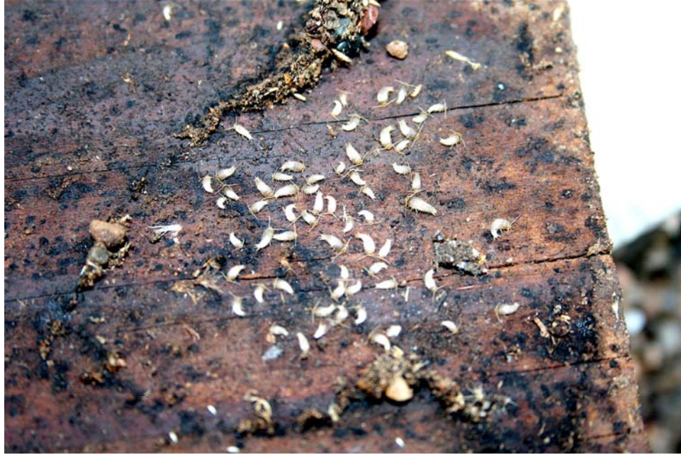
Figure 5. Example of myrmecophiles, silverfish ( Thysanura ), under a cover board placed over part of a Pogonomyrmex rugosus nest. Portions of the attachment of a large ant chamber can be seen on the underside of the wood board, at Castolon, Big Bend National Park, Texas, January 2007.

In the Diptera, syrphid fly adults of some species (e.g., Microdon baliopterus ) lay their eggs on or near the host nest, and the larvae crawl down to the host larval chambers and feed on the host larvae (Van Pelt and Van Pelt (1972). In the Hymenoptera, several eucharitid genera, including Orasema , produce larvae which are endoparasitic on the host brood.