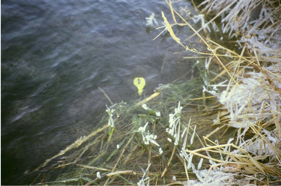
FIG.3. Photo showing cobble with tag Malad River, Idaho, December 8, 2005. The marked cobbles are visible at distances of several meters (depending on water clarity).