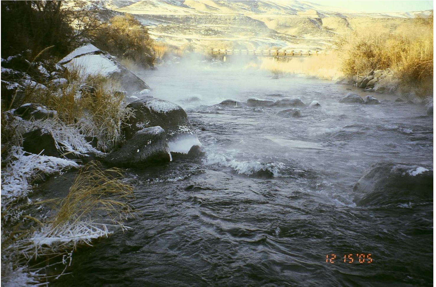
FIG.1. The Malad River, just above its confluence with the Snake River, Gooding County, Idaho, December 15, 2005. Cobbles along the left (south) side of the river were used in this study