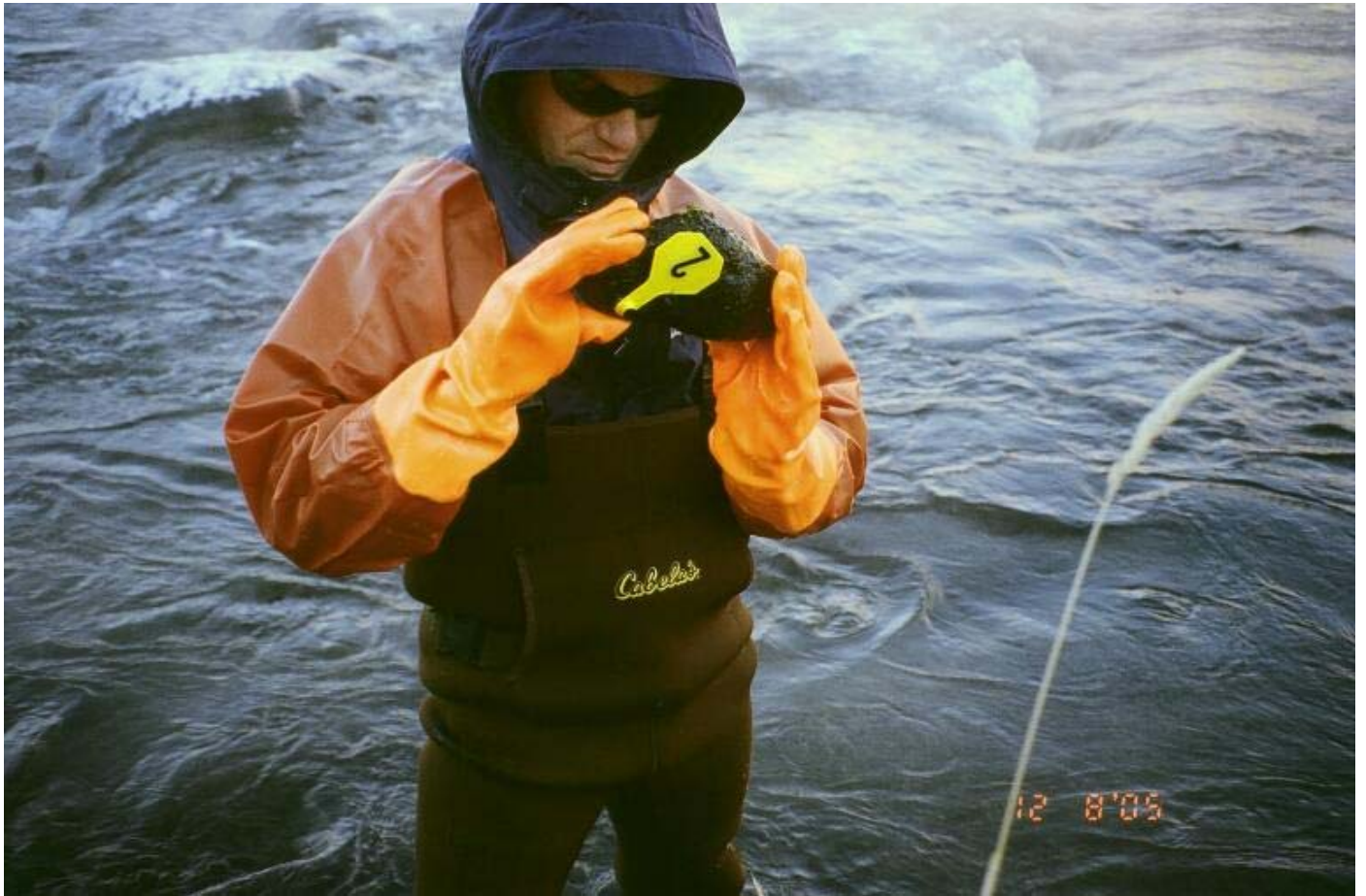
FIG.2. Photo showing cobble with tag Malad River, Idaho, being examined for Taylorconcha serpoenticola , December 8, 2005. Bliss Rapids snails occur on the underside (side opposite the tag) of the cobble.