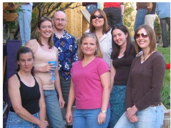
Our third year students gather for a class photo at the department's end of the year gathering