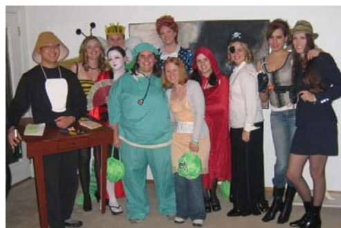
Psychology students gather for a celebration of Halloween

We encourage other alumni and friends of the department to consider making a donation. Donations of $25 or more will be listed in next year's newsletter. Donations can be made payable to the ISU Psychology Local Account . Thank you! We appreciate your support!